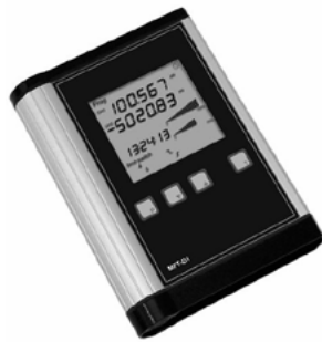
Example Application (Assembled View)