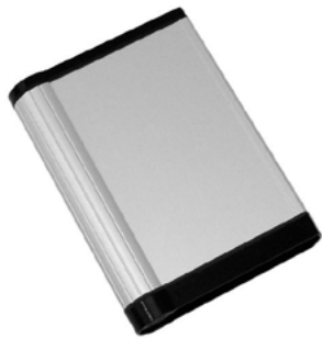
Diecast End Plates Attached (Assembled View)