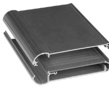
With P.C. Board Mounted (Two piece version)